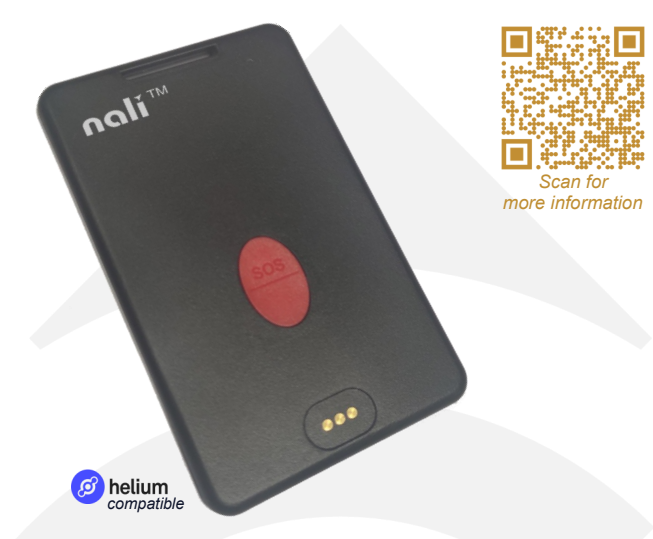
Nali-N100 location tracker is water resistant measuring 3.38 x 2.13 x 0.20 inches (85x54x5mm).